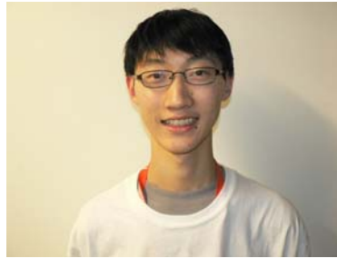
STATE COMPTROLLER Brian Wang Lake Bluff, IL